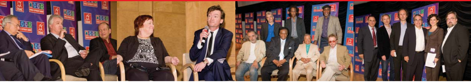
All pictures © 2009 Max Taylor Photography / CISAC